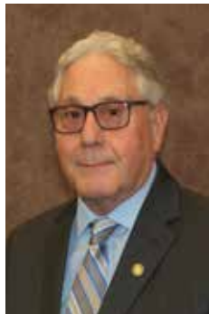
DONALD BURCHETT At-Large